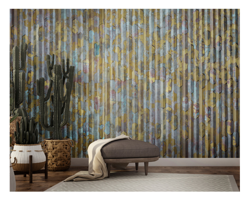
SCALA Metal fabric modular panels.